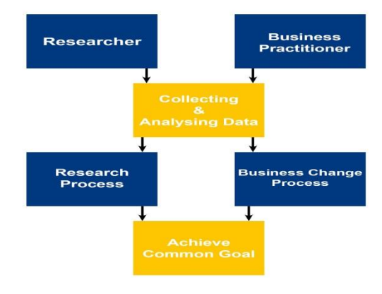
Fig 1: Action Research Method in Simple.

Choosing the right research strategy is very important to complete the research (implementation of Deming's philosophy) in time scale and quality. According to the literature available, Action Research is most suitable for this particular research type. According to Yadam [11], many researchers defined and looked at action research in different ways. But the standard definition was given by Stefan & Goran [6], "Action Research means a research practice and a business practice integrating to achieve a common goal". The following diagram illustrates the process of action research in simple format (researcher and business practitioner come together and achieve common goals).